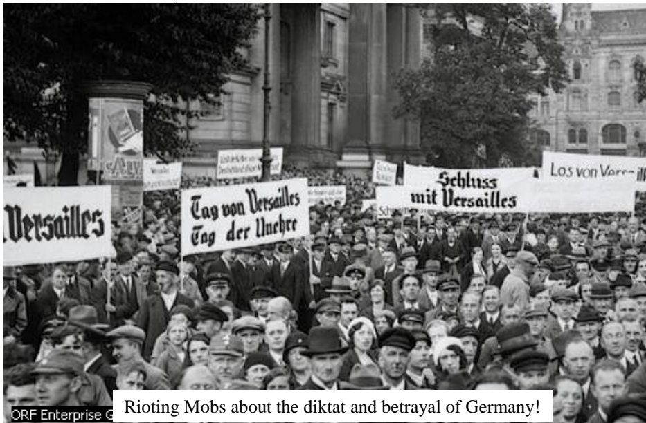
Rioting Mobs about the diktat and betrayal of Germany!